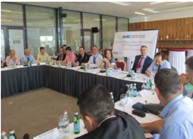
Participants in the seminar organized by the OSCE Mission in Kosovo on 11-12 September in Prishtinë/Priština