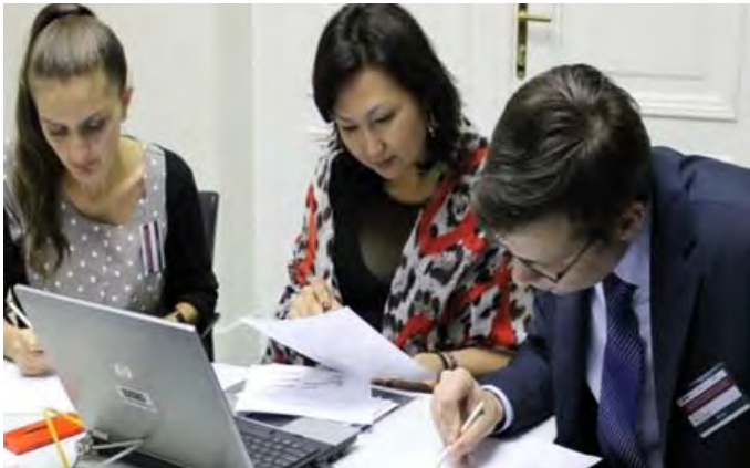
Participants during a workshop on Cross-Border Co-operation against Corruption and Money Laundering involving officials from OSCE participating States in Central Asia, South Caucasus and Eastern Europe as well as international experts, Vienna, 2 October 2014.