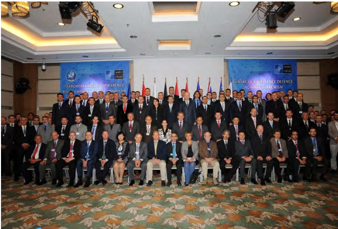
Participants in the NATO Terrorism Experts Conference on 15-16 October 2014 in Ankara, Turkey (COE-DAT)