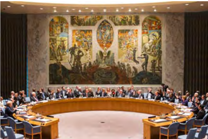
The Security Council unanimously adopts resolution 2178 calling on all UN Member States to co-operate in efforts to address the threats posed by foreign terrorist fighters (United Nations)

The United Nations Security Council adopted on 24 September 2014 its resolution 2178 on the threat posed by ‘foreign terrorist fighters’ . The resolution was adopted unanimously under Chapter VII of the UN Charter and has been described by some as perhaps the most important resolution of the Security Council in the field of counter-terrorism since UNSCR 1373 (2001). UN resolution 2178 (2014) is available here in all official UN languages: