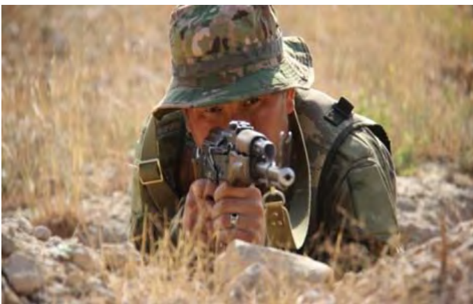
The OSCE Centre in Bishkek supported the “Barrier–2014” simulation exercises in the Ala-Buka district of Jalal-Abad province, 17 September 2014.