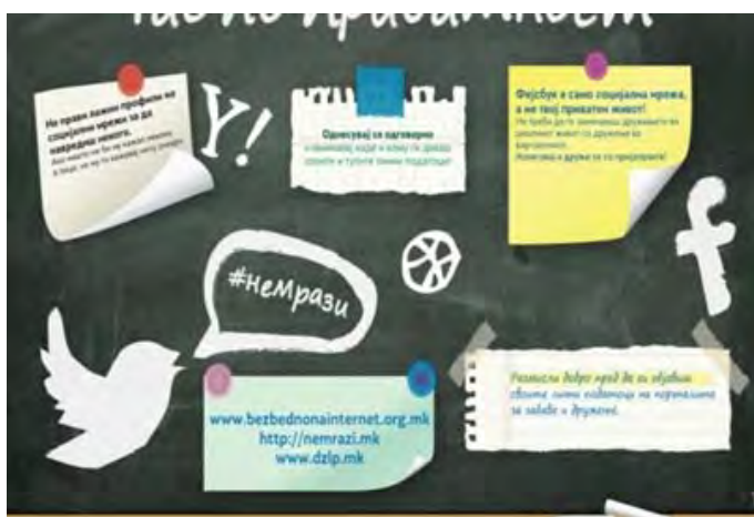
Posters with messages against hate speech distributed to high school students as part of an OSCE-supported project.