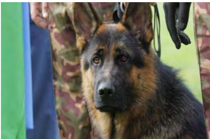
A German Shepherd stands at attention during a canine competition in Kazakhstan, Almaty, 6 October 2014.