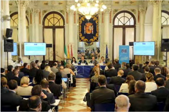
International conference on terrorism and organized crime held by the Council of Europe on 25-26 September 2014 in Malaga, Spain (Council of Europe)