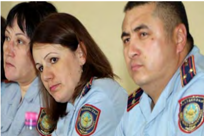
Police inspectors and officers attend an OSCE-supported training seminar.