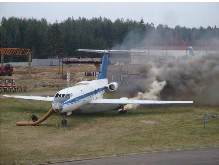
Special units from Belarus responded to a high jacking scenario as part of an anti-terrorism exercise on 31 October 2014