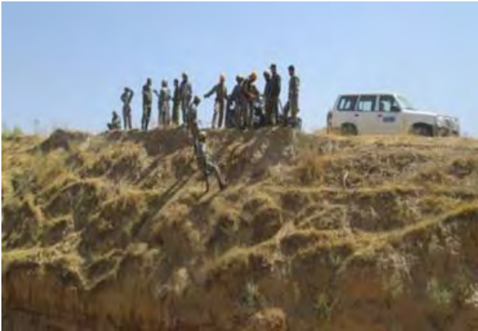
Afghan border police officers during an alpine training course rappelling from the cliff Bulbulchashma, 12 August 2014.