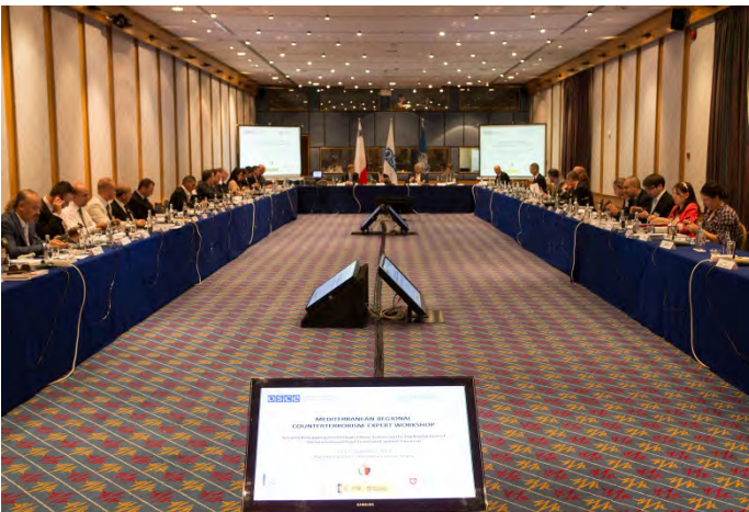
Participants in the OSCE-UNODC Mediterranean Workshop held on 16-17 September 2014 in Valetta, Malta (OSCE)