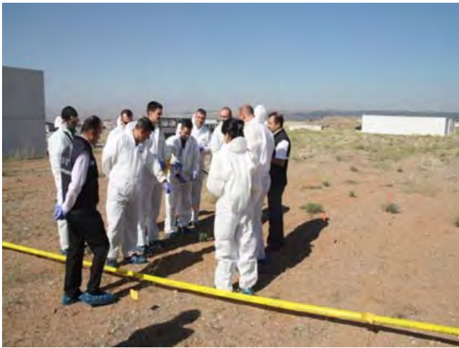
Participants in the training course on crime scene investigation after terrorist attacks, which was organized on 21-26 September 2014 by the OSCE Mission to Skopje (OSCE)